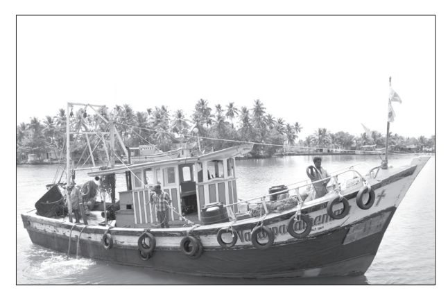
Fig. 1. Deepsea shrimp trawler at Kollam

belonging to families like Rhinochimaeridae, Echinorhinidae, Centrophoridae and Squalidae are getting high values in the landing centres.