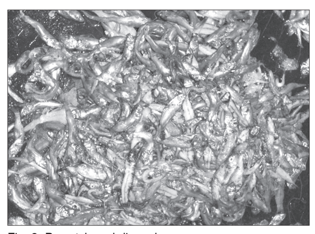
Fig. 2. By-catch and discards