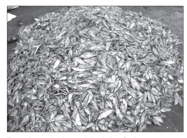
Fig. 3. Low value by-catch landed at Cochin

Among the lanternfishes, benthopelagic myctophids dominated followed by Neoscopilids. Diaphus was the most abundant genus followed by