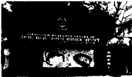
A view of the CMFRI stall

A marine aquarium stall was set up by Vizhinjam Research Centre of CMFRI at Trivandrum in connection with "Flower Show 2001" from 20-31 January and bagged the first prize.