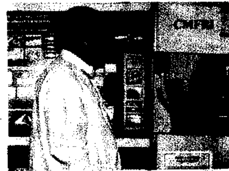
Union Minister visiting the CMFRI stall in the International Seafood Show

The Visakhapatnam Research Centre of the