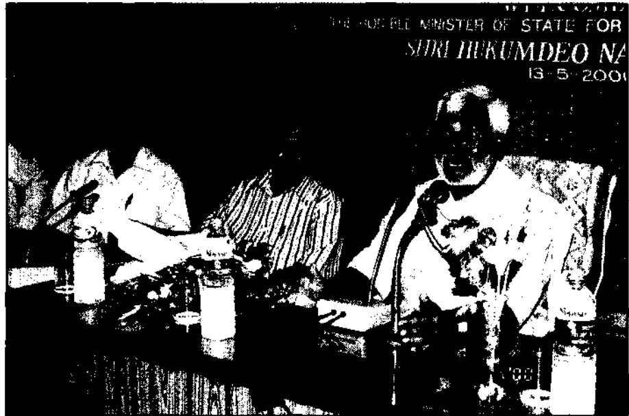
Shri Hukumdeo Narayan Yadav, Honourable Minister of State for Agriculture, Government of India addressing the staff members of the CMFRI