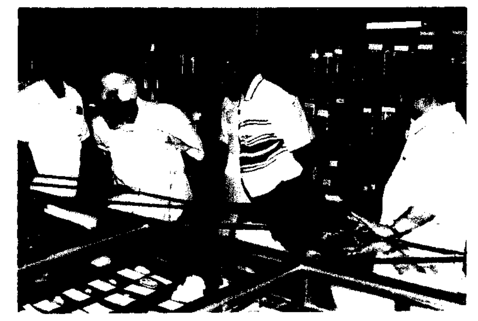
Honourable Minister Shri. Hukumdeo Narayan Yadav viewing the specimens kept at the museum at Mandapam

CMFRI has succeeded in the attempt of cultivating agar yielding seaweed, Gracilaria edulis in the near shore areas of Njarakkal, in Ernakulam District. Few selected plants, out of those collected from Mandapam, Tamil