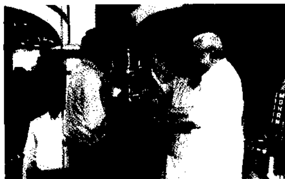
Shri. K. K. Philipose on behalf of the CMFRI receiving the "Fisheries Ministers Trophy for the Best Institutional Performance from the Hon. Chief Minister Shri. E. K. Nayanar

An all India aquarium show and exhibition was conducted by the Department of Fisheries, Government of Kerala and the Kerala State Cooperative Federation of Fisheries Development at Kanakakunnu Palace, Thiruvananthapuram from 6