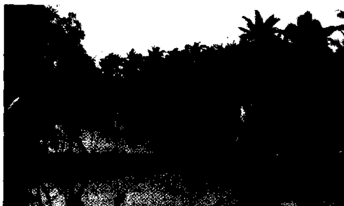
A model crab farm

Crab harvest mela marked the successful culmination of the crab culture programme undertaken by 10 SC/ST farmers, at Chellanam under the Special Component Plan sponsored by the Ernakulam District Administration. The programme was initiated with the assistance of Rs 10,000 provided to each of the fishermen to undertake crab farming. Technical guidance was provided to the farmers through discussions and visits. The programme was monitored regularly by the scientists of CMFRI. The