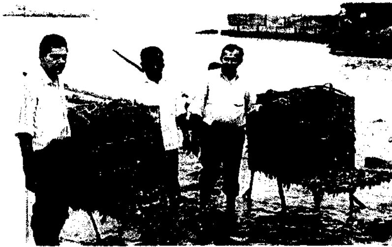
Pearl oysters and mussels farmed by sea bottom farming using high density stocking pedestal cages

A new farming method for cultivating pearls, mussels, finfishes and other organisms in shallow sea bottom using cages has been developed by the Institute. The new designs of high density stocking cages include the cages with multiple radial pedestals known as satellite cages, cages with extra lateral pedestals and the two-in-one cage with a trap mouth for farming cum-fishing. The fabrication of the cage is easy and it is portable. The cages also act as fish attracting device and hence it is possible to increase the fish biomass in the sea.