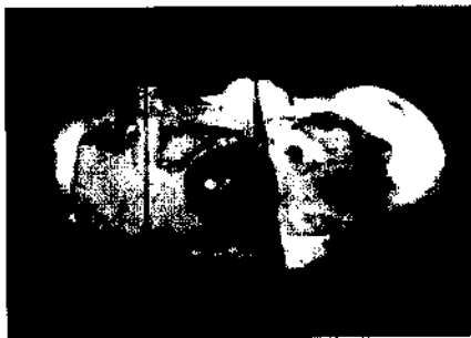
Pearl oyster with pearl produced in the on-shore system

CMFRI achieved success in the on-shore production of marine pearls at the shore laboratory at the Visakhapatnam Research Centre. Eighty pearl oysters were implanted with 3 mm nuclei and 18 A grade pearls, 12 B grade pearls and 7 C grade pearls were obtained.