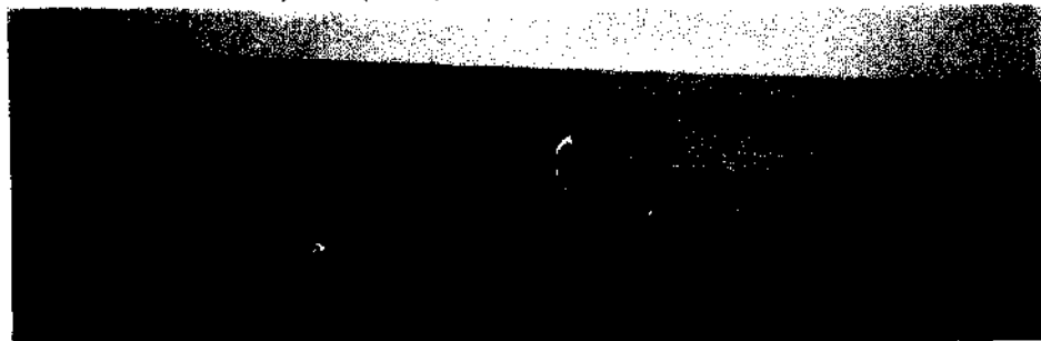
The longline unit moored in the sea

and thus a 20 m x 20 m longline mussel farm is set up. A group of 15 fishermen of the locality is participating in the programme during its first phase. The group consisting of men and women is being trained in seed collection, seeding of the ropes, mooring the longline and farm maintenance.