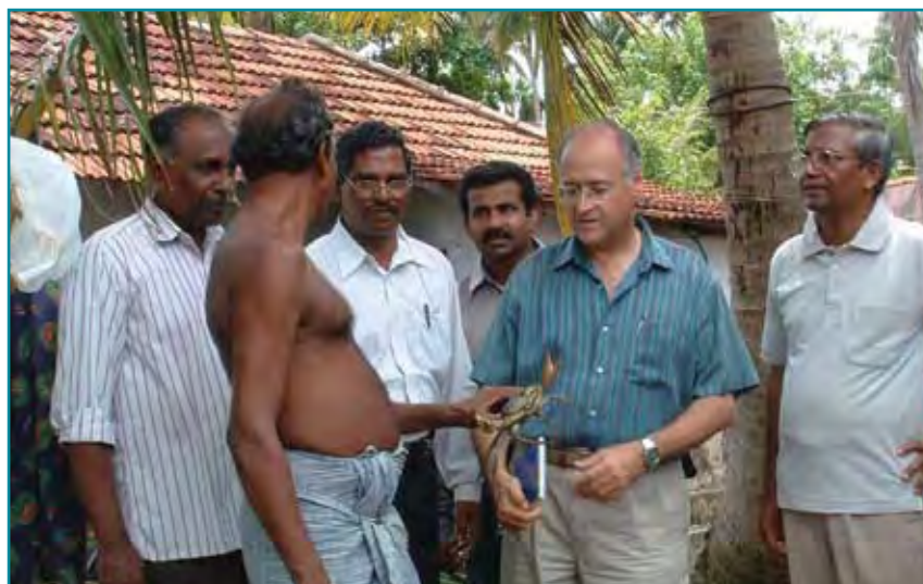
Mud Crab Culture – A remunerative venture.

Technology for the monoculture of uniform sized juvenile crabs ( Scylla tranquebarica ) was recommended. The major elements of the technology were: proper water exchange through fabricated sluices (size of sluice 60 cm width and 135 cm height); stocking of uniform sized juvenile crabs (stocking rate 4800/ha, size 150-200 g); feeding rate of 8-10 per cent of body weight with feeds such as trash fish and slaughter waste in the ratio of 2:1; and fencing of ponds (45° angle) using nylon nets to prevent crabs escaping