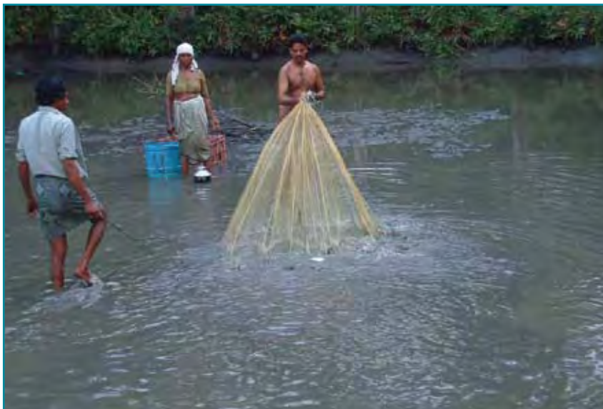
Farmer harvesting Chanos chanos – usually at night or early morning.

Polyculture of finfish was the recommended technology. Predators were eradicated using mahua oil cake. Water exchange was maintained through fabricated sluices and natural entry of fish was regulated. Combination of Chanos chanos and Mugil cephalus were stocked at the rate of 20 000/ha. Mugil cephalus at the harvesting stage attained a mean weight of 440 g and mean length of 35 cm, where the mean weight and length of Chanos chanos were 200 g and 26.5 cm, respectively. The period of culture was 11 months.