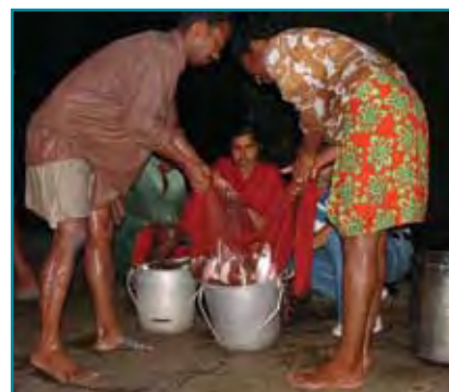
Harvesting of Mugil cephalus

Among IVLP farmers, 80 per cent preferred scientific fish/crab culture practices, whereas among 'others' 64 per cent of the farmers favored the scientific farming practices. It could be inferred that training and other extension activities succeeded in