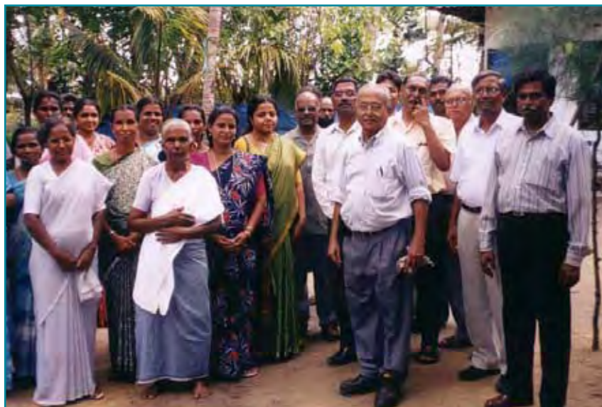
Group of stakeholders with experts.

The extension strategy adopted in IVLP is very much participatory in nature with a vision of an integrated whole village development ensuring greater scientist-farmer linkage and accessibility for farmers to the technologies generated by CMFRI