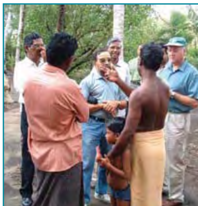
Scientist-farmer interaction – location specific problem identification.

The existence of five typical micro-farming situations such as tide-fed brackish water systems, open sea-based coastal agro-ecosystem, homestead animal husbandry and poultry farming system, rain-fed agro-horticulture systems and low-lying seasonal paddy ( pokkali ) lands were identified. Various technological interventions were sketched out to suit these micro-farming systems, on the one side, and to achieve the broader objective of technology assessment and refinement, on the other side. Based on this, an action plan was outlined under three broad categories - fisheries, livestock and