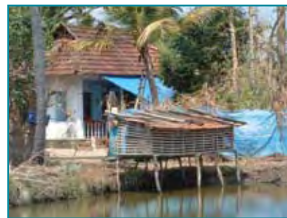
Integrated farming of fish and poultry.

There were a number of observations that indicated the positive impact of the resource-specific techno-interventions of IVLP in the project