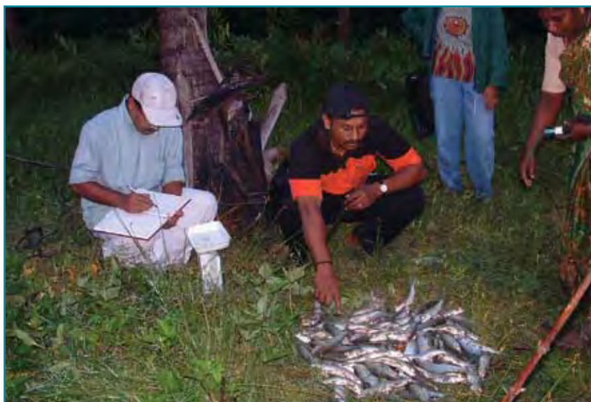
Harvesting of Chanos chanos .

The net return was Rs0.443 million/ha under the regime as against 0.254 million/ha with farmer's practices. The benefit/cost ratio was 1.64 and 0.96, respectively (Table 2).