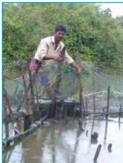
Biculture of crab and Mugil cephalus .

profitability with the diversification of farming practices resulted in an increase in the demand for farms. The fish/crab collectors, who were marginal fishermen, saw an increase in demand for their labor from about 80 to 120 labor days per annum (seasonal) and became conscious of the need for uniformity in the size of fingerlings for stocking. Farmers became aware of the components of culture practices like monoculture, biculture and polyculture. In the project village, an underutilized area of 22.3 ha was brought under the newly introduced fish culture practices. This created a demonstration effect on farmers from neighboring villages who visited the more progressive farms in the project village and also adopted the modified interventions. The increased level of awareness escalated the demand for unutilized ponds and embankments. Social participation and interaction among villages increased. This was more obvious in the case of women farmers. Inter and intra functional linkages between farmers, research stations, state departments and other organizations were evolved. Some farmers functioned as consultants and this gained them social recognition. Collective action among farmers