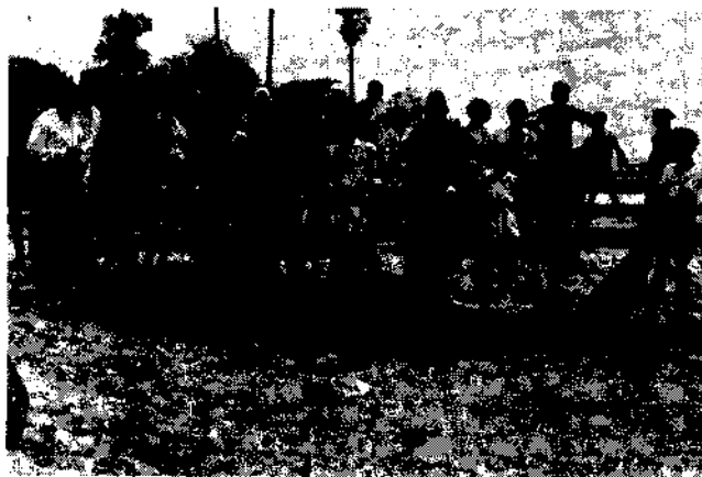
Fig. 1. The whale shark Rhineodon typus landed at Kaveripattinam.

* Reported by M. Radhakrishnan, Cuddalore Field Centre of C.M.F.R. Institute, Cuddalore.