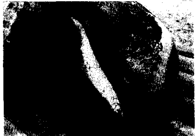
Fig. 2. The head of Risso's dolphin showing the injured portion and teeth on the lower jaw.