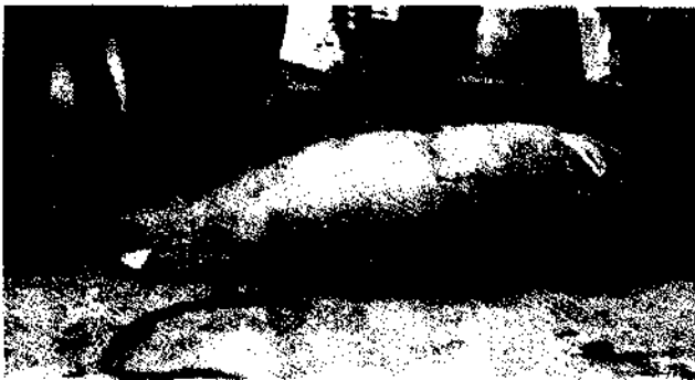
Fig. 1. The giant groupers landed at Paradeep, Orissa.

A giant grouper, Epinephalus lanceolatus (Bloch) ( Promicrops lanceolatus ) locally called 'Kaibaley' measuring 202 cm in total length was landed at Paradeep on 18-12-'97 by a trawler operated 12 km south of Paradeep (Fig. 1). The fish with an approximate weight