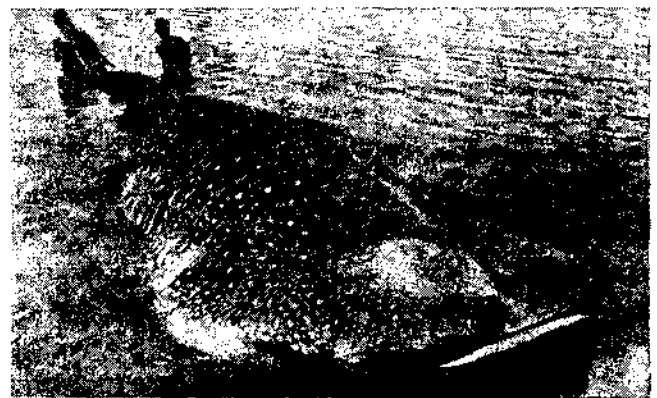
Fig. 2. Whale shark 765 cm in total length landed on 14-5-'89 at Madras.

place of catch, upto the landing centre. This was also not sold for want of demand and was thrown into the sea. The morphometric measurements are given in Table 1.