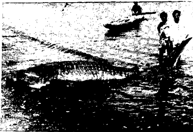
Fig. 1. Whale shark 506 cm in total length landed on 6-3-'87 Kasimedu.