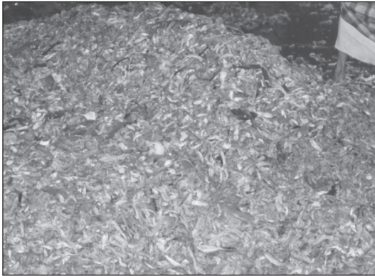
A heap of non-edible trawl by-catch at Neendakara, Kollam

sea conditions or bans imposed by the governments as in Kerala, Tamilnadu, Andhra Pradesh or socially self-imposed ban as in Karnataka. Intense mechanized trawling in the coastal fishing grounds by using a trawl net of 30 m horizontal, 3-4 m vertical mouth opening, a cod end mesh of 18- 35 mm and a heavy tickler chain in