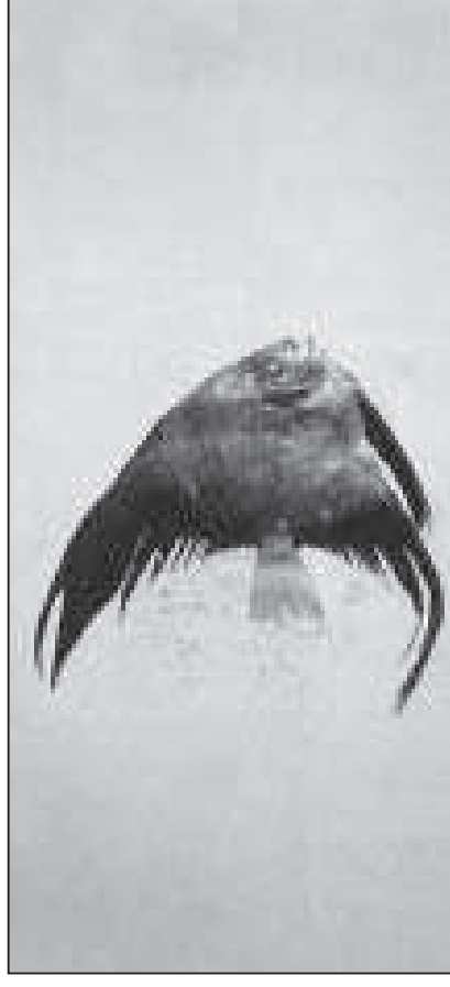
Juvenile of Platax sp.

for the first time this year in December '03 at New Ferry wharf and Sasoan Docks. The total length ranged between 100-120 mm. Juveniles are discarded, while the adults fetch good price in the local market, as they are edible and palatable. It is quite possible that this unusual landing of juveniles in dol nets in good numbers was due to the young ones coming into the shallow waters to escape strong currents and perhaps for the search of food. They are usually found in shallow waters among weeds, sea grass or coral and small specimens of Platax sp. are very popular aquarium fishes. The black vertical bars on the body fade with age.