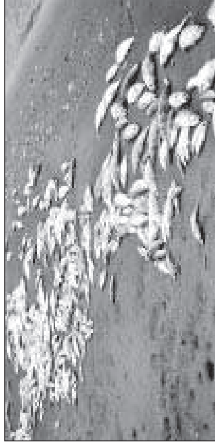
Euthynnus affinis washed ashore at Ratnagiri

On 9-9-04 large number dead Euthynnus affinis were washed ashore at Ratnagiri coast. The local fishermen reported that the dead low quality fishes from the gillnet are invariably discarded in the sea and washed ashore.