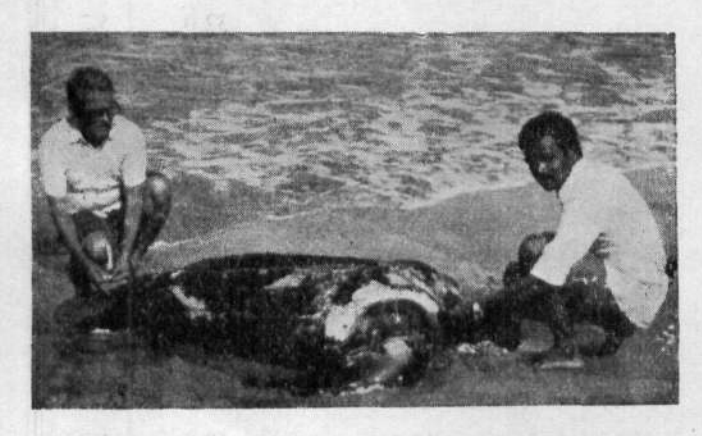
Fig. 1. Latero-dorsal view of the leatherback turtle, washed ashore at Devbag (Near Malwan), Maharashtra coast.

There have been instances of landing of marine turtles along the Maharashtra coast. The landing of three out of the five species of turtles found in the Indian seas is reported here. Of these species, the leathery or leatherback turtle (Dermochelys coriacea) locally known as 'Kuruma kasav' (Fig. 1) is the rarest and the largest while the other two namely olive ridley