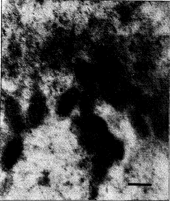
Fig. 1. Complete viral particles in the gill nucleus. Note the oblong-shaped, rounded and segmented appearance of the capsids (stained with uranyl acetate and lead citrate). Scale bar = 100 nm.