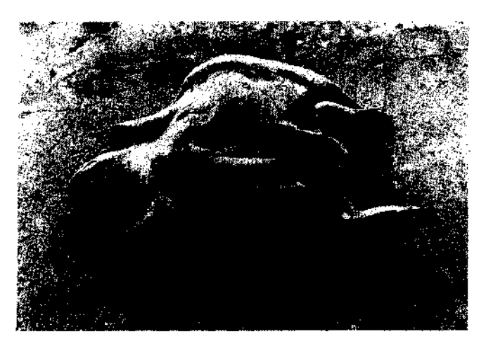
Fig. 2. Ventral view of the turtle.