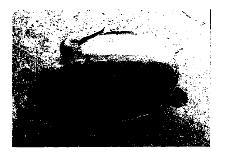
Fig. 1. Dorsal view of the turtle.

On enquiry it was learned that altogether three turtles were caught in a 'dol' net of which the two live ones were released into the sea. The turtle weighed 34.8 kg.