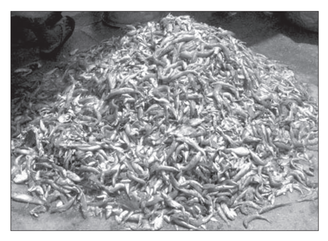
Fig. 1. Heavy landing of juvenile lizard fish along with silverbellies at Neendakara

on 25.2.2008, a heavy landing of lizard fish of about 1,000 kg along with silverbellies by trawlers was recorded at Neendakara (Fig. 1). The catch was from Chavara area (off Neendakara) caught from 10-20 m depth. Among the lizardfish catch, Saurida undosquamis and among the silverbellies, Leiognathus elongatus were the dominant species. The length range of S. undosquamis (sample size: 72) was 110-170 mm, with the modal length of 150 mm. The length range of L. elongates (sample size: 140) was 20-70 mm with the mode of 50 mm. Most of the specimens of S. undosquamis were in immature stages. Stomach of the fish was observed to be full. Since the catch mostly consisted of juveniles, it was utilized for making manure.