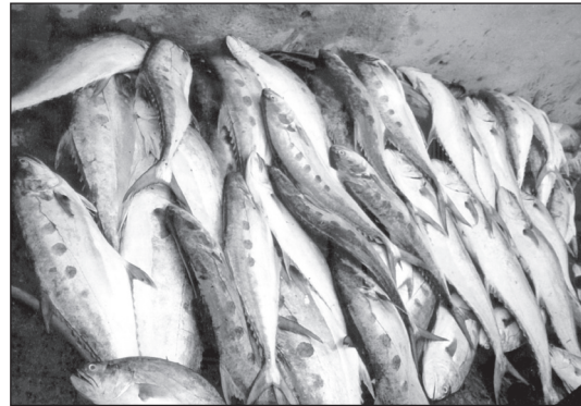
Fig. 1 S. commersonianus

The gears operated off Kovalam were mostly hooks & line operated from catamarans. The size range of S. commersonianus (TL) was 75-110 cm. with mean size at 88 cm. The weight range was 2.6 to 10 kg with average weight of 4.0 kg.