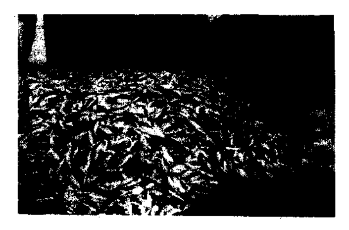
Fig. 1. Portion of the catch.