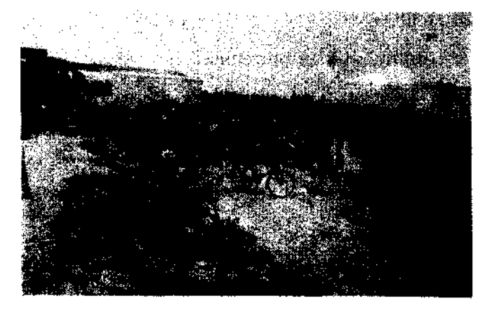
Fig. 4. Insulated vans loading the catch at the centre.

landing centre and the price per basket containing 180-200 fishes weighing about 25 kg, ranged between Rs. 180-190. Since local consumption was less, the bulk of the catch was transported by trucks and insulated vans to markets in Andhra Pradesh and Kerala states.