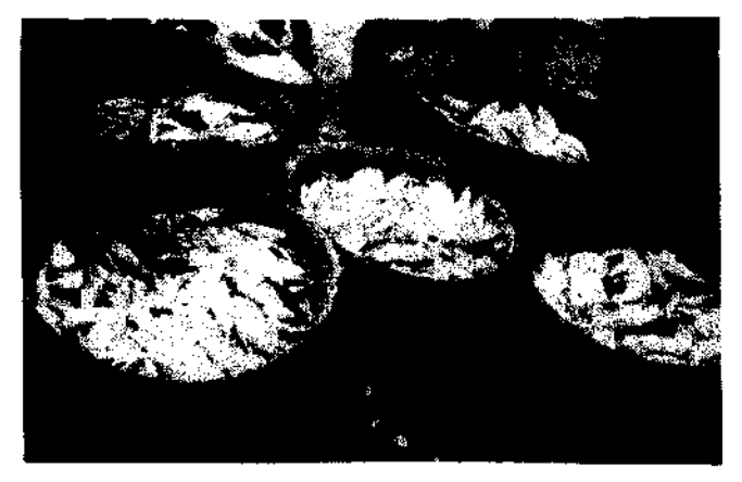
Fig. 2. Auctioning of the catch at the landing centre.

Length frequency data collected revealed that the size range of the species varied between 170-174 mm and 200-204 mm with a predominant size group at 185-189 mm. Few fishes examined were in immature stage of gonadial development.