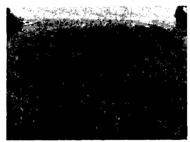
Fig. 1. The catches of oil sardine ready for auction.

The entire catch was packed with ice and transported to Kerala to get a better price. The whole-