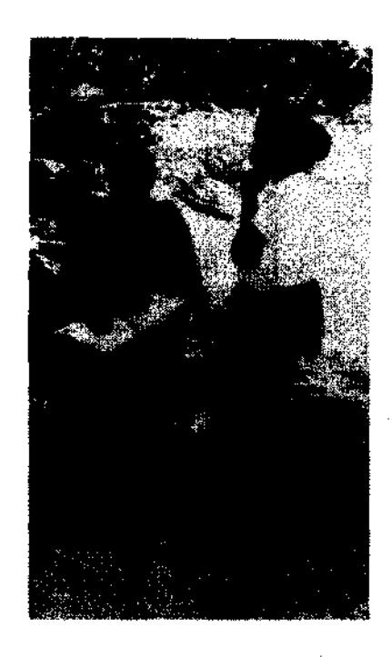
Fig. 9. Project leader, assessing knowledge gain of fisherwomen as a result of training programme.

The level of knowledge in each subject area was measured before the initiation of the programme and immediately after the programme was over. The difference proved a significant level of increase in their level of knowledge. The gain in knowledge can be attributed to the success of this project. The impact of the demonstration on scientific prawn culture also was considerable having brought desirable changes in their level of