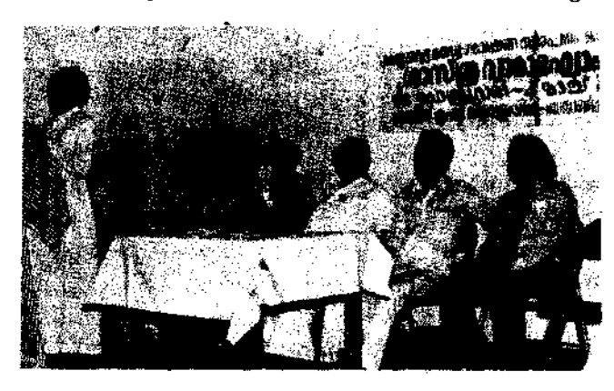
Fig. 2. A view of the village level meeting in connection with stocking of prawns.