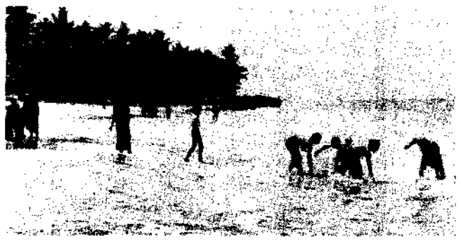
Fig. 4. Training in collection of prawn seeds from surf.