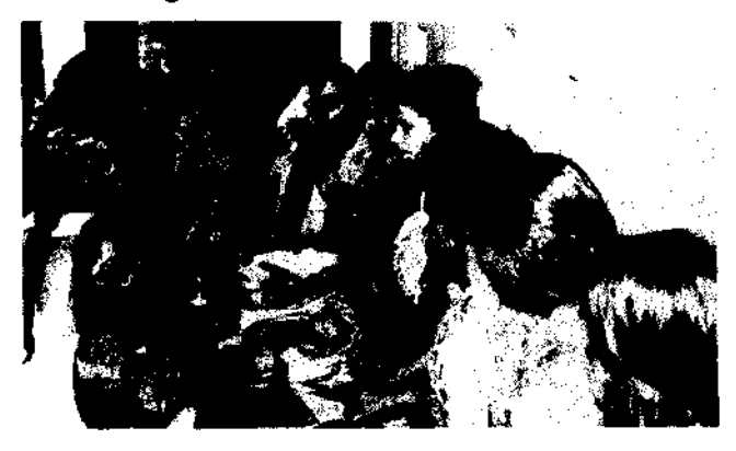
Fig. 8. Training women in preparation of diversified products from low cost fish.

This programme was envisaged to link the fisherfolk with various developmental agencies. The Manager of the lead bank, The Union Bank