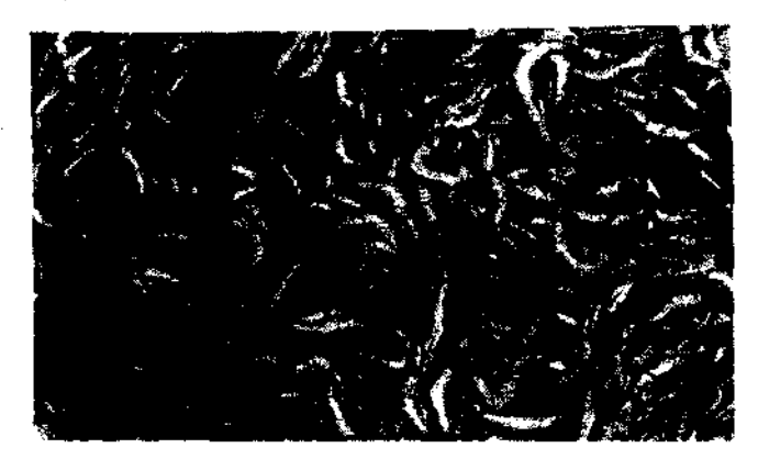
Fig. 7. A view of the harvested prawns, from the water canal.

CMFRI has developed technologies for production of prawn seeds in small hatcheries which can be established within the limited financial means of local fishermen families. If a spawner is available such a hatchery can be set up at a very low cost. The project area having on one side sea and the other side being large prawn culture fields was felt having wide scope