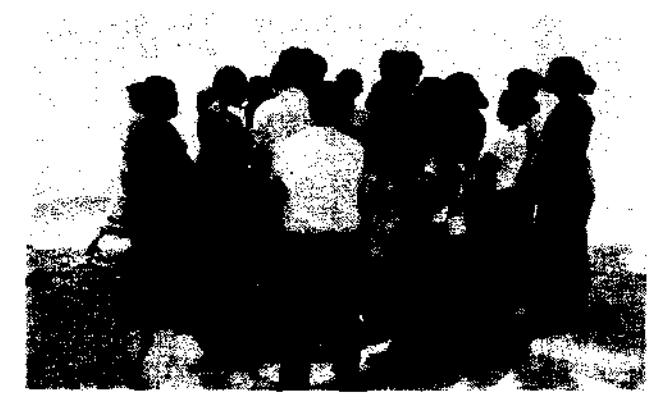
Fig. 1. Group discussion with fisherwomen in the village.

The fisherfolk under the project were trained in scientific prawn culture through lecutres, demonstrations and field trips. Classes