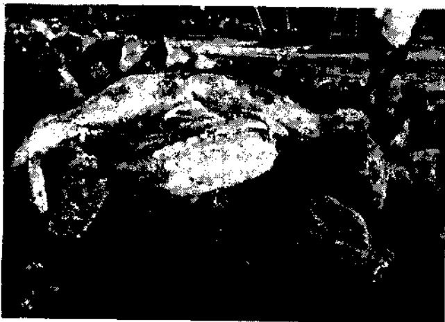
Fig. 1. The decomposed head portion of the whale.

coastal district of Trichur, Kerala. The decomposed body of the whale was broken into three parts by lashing against the granite sea wall (Figs. 1-2).