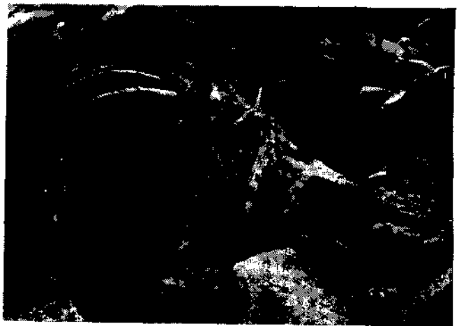
Fig. 2. The trunk of the whale with ribs exposed.