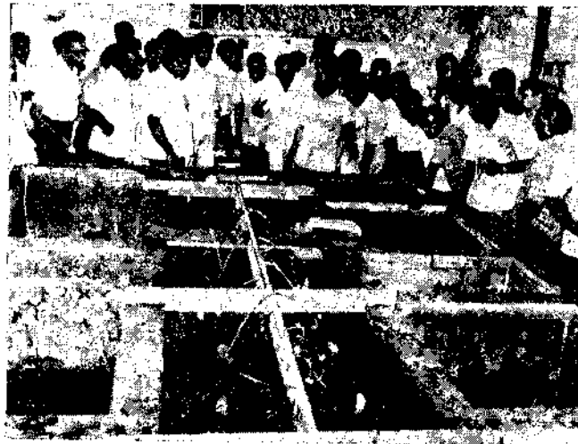
The field programme for the delegates concluded with a visit to the Regional Shrimp Hatchery of the Department of Fisheries, Government of Kerala, at Azhikode.