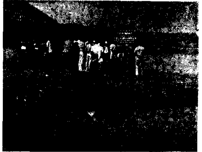
A visit to the Lab-to-Land centre of CMFRI at Valappu where the technology of prawn culture is under transfer to the member-families of a Harijan society.