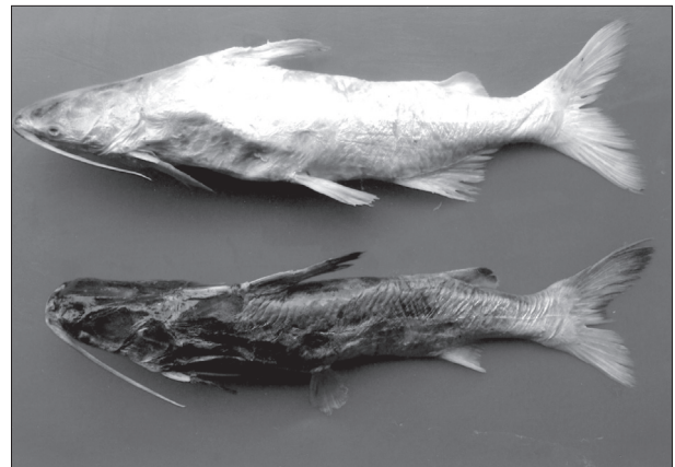
Fig. 2 : Albino and normal specimen of Osteogeneiosus militaris