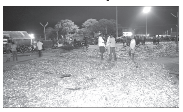
Fig. 1. Heaps of juvenile ribbonfish at Tuticorin Fishing Harbour for auction (each heap weighs 100 kg)

got heavy catch of ribbonfishes (Fig. 1). Catch varied between 10,000 and 20,000 kg/boat based on their