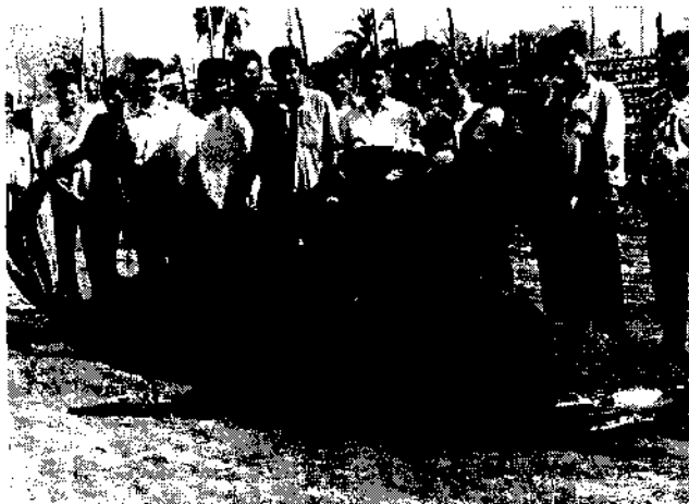
Whale shark landed at Dakti Dahanu

On 21st December 1999, a whale shark Rhincodon typus Smith (Male) got entangled in a nylon gill net (locally called wagrajal ) at about 0400 hrs., at a depth of 40M. was landed at Dakti Dahanu & Gangwada. It was alive but subsequently died at about 0800 hrs. on the same day. The shark towed to the shore was laying for three days as there was no demand for the flesh and fins. The various body measurements taken were as follows.