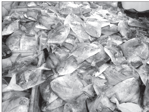
Fig. 2. Heavy landing of Chinese pomfret at New Ferry Wharf

Chinese pomfrets are found in the shelf waters at 80 m depth off Mumbai and in the Gulf of Kutch. Abundance of this species varies from year to year and generally they are not caught in such large numbers. Such an unprecedented catch of adult specimens is reported for the first time.