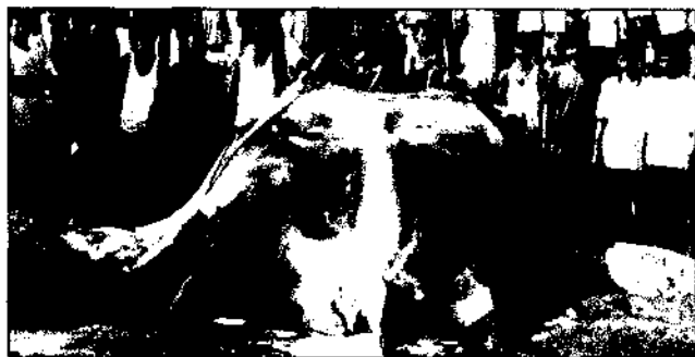
Rear view of Manta birostris (Walbaum)

On 24-09-02 one female giant devil ray Manta birostris (locally called "Ulack") was entangled in a bottom set gill net at about 16.00 hrs from a depth of 45-50m, off Kelwa-Dandarpada, Maharashtra.