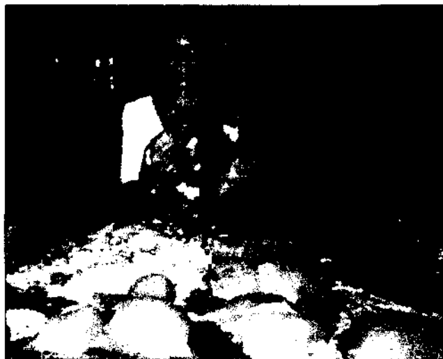
Processing of jelly fish

ority to collect jelly fishes than regular fishing activities. It provides income and additional employment opportunities to the fishermen by way of cleaning and processing. The processing industries are functioning in the fishing villages such as Nadukuppam, Anichankuppam, Mudaliarkuppam, Chettinagar, Anumandaikuppam,