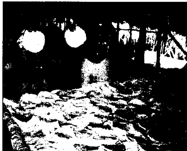
Processed jelly fish