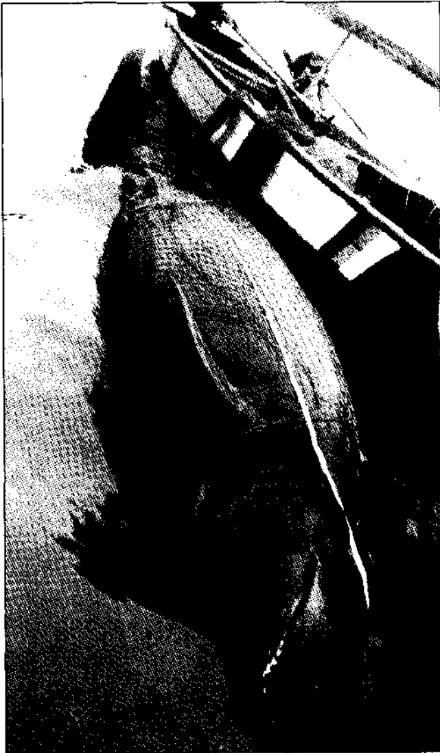
Fig. 1. Female false killer whale, Pseudorca crassidens (Owen), 515 cm in length caught at Ennore near Chennai

margin near the middle which is about 1/10 of the body length. Body elongated and black in colour. The dorsal fin was distinct and placed just behind the mid point, falcate and pointed at the tip. The mouth was curved, teeth large, round in cross section, slightly curved, pointed with 8 to 11 pairs in upper and lower jaws. The false killer whale attains a length of 550 cm and feeds mainly on fishes and cephalopods. They attain maturity at 4.25 - 4.50 m, and the breeding season is fairly extensive.