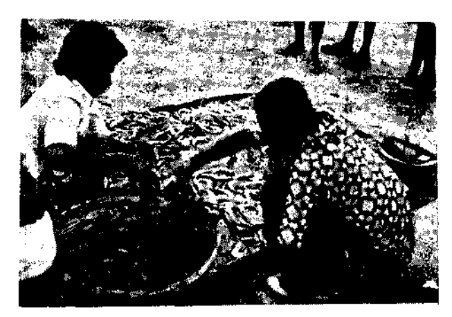
Figs. 4 & 5 Prawn harvest

the temperature from 29.5 to 34.0°C. The depth of the water in the ponds was 50-70 cm. Harvesting was done on 12-11-1980 five months after stocking (Figs. 4 and 5).