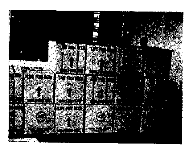
Fig. 1 Prawn seeds packed in polythene bags inside cardboard cartons ready for transport.

Land programme of the Institute at the Vypeen Island and Quilon, some were supplied to the prawn Culturists at Goa and Tuticorin and also to the Calicut Research Centre of the CMFRI for experiments in the polythene lined ponds on the sandy beach of Calicut. The main objective of these supplies was to study the problems associated with long distance transport and to evaluate their growth and survival in different ecological conditions. A report on their growth and production in the polythene-lined ponds at Calicut is given elsewhere in this issue. The consignment sent to Tuticorin is dealt with below.