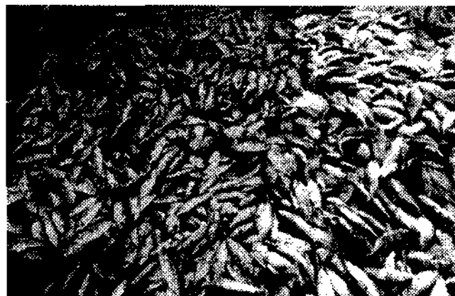
Fig. 2. View of mackerel catch brought by the trawlers at Mangalore Bunder.

to preserve the catch. The price of fish which was Rs. 5/- per piece earlier declined to less than a rupee per piece on the first two days. Part of the catch was taken for drying. However, later, ice was made available and the price stabilised. It is reported that the catch was frozen in the fish hold itself to be unloaded and sold later when the catch was meagre consequent to the ban on the operation of mechanised units during June - August. The unexpected high mackerel landing along the Mangalore coast during the close of the fishing season has thus benefitted the trawl operators immensely.