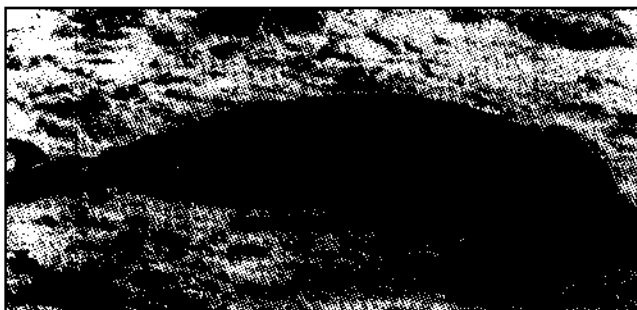
Fig. 1. The black porpoise landed at Sangumal (Palk Bay) near Rameswaram

Finless black porpoises are common in the nearshore waters and dead ones were washed ashore on many occasions along the Palk Bay coast around Mandapam and Rameswaram. On 31.01.2001, a female black porpoise, Neophocaena phocaenoides (Fig. 1) was landed at Sangumal (Palk Bay) near Rameswaram. Its total length and weight were 150 cm and 40 kg respectively. In the neck region the flesh was eaten by stray dogs. The porpoise was caught by gill net locally called as Vali Valai, operated off Rameswaram in the Palk Bay at a depth of 14 to 18 m. The morphometric measurements of the specimen are given in Table 1.