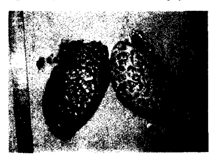
Fig. 3. Renculii of T. aduncus.