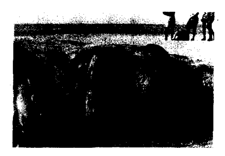
Fig. 5. Close view of the male copulatory organ of B. musculus.