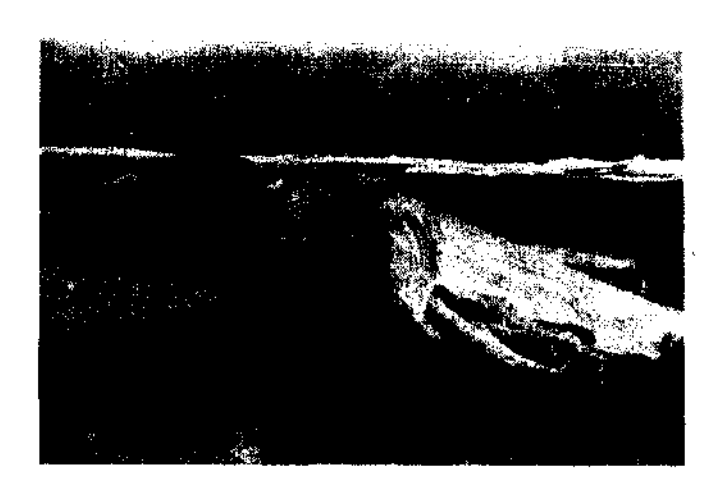
Fig. 4. Balaenoptera musculus stranded off Dhanushkodi.