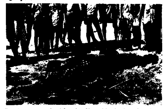
Fig. 3. A 262 cm long female of bramble shark, Echinorhinus brucus.

During the course of the present study a 262-cm long (total length) specimen of the bramble shark, Echinorhinus brucus , (Fig. 3) was found to contain a record number of 52 embryos (Fig. 4) against the maximum number of 24 embryos reported by Campagno (FAO Fish. Synop, (125) Vol. 4, Pt. 1:26, 1984).