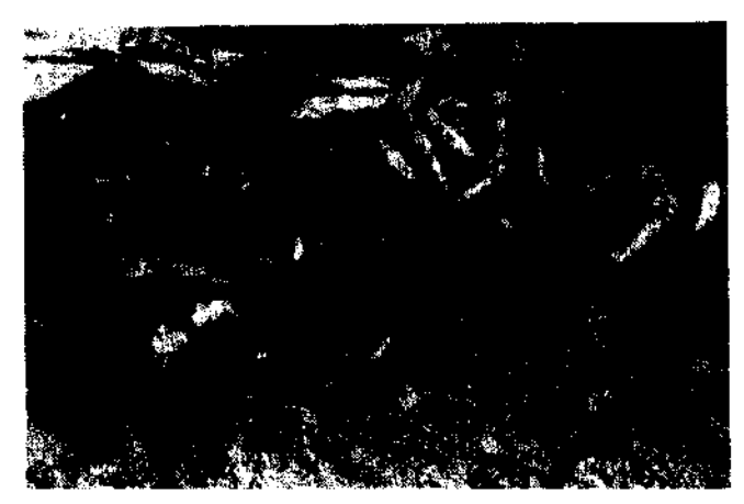
Fig. 4. The record number of 52 embryos found in the female bramble shark shown in Fig. 3.