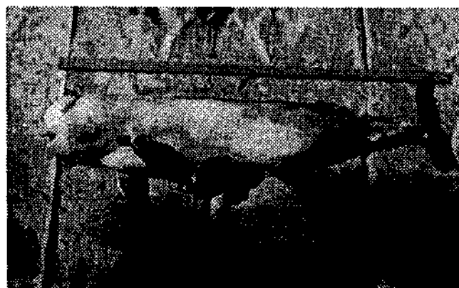
Fig. 2. Photograph showing porpoise N. phocaenoides washed ashore at Ullal beach.

The whale measured approximately 12 m. The presence of prominent vertical grooves on the belly and short and triangular dorsal fin (length 80 cm, height 42 cm and base 48 cm) suggest that the stranded