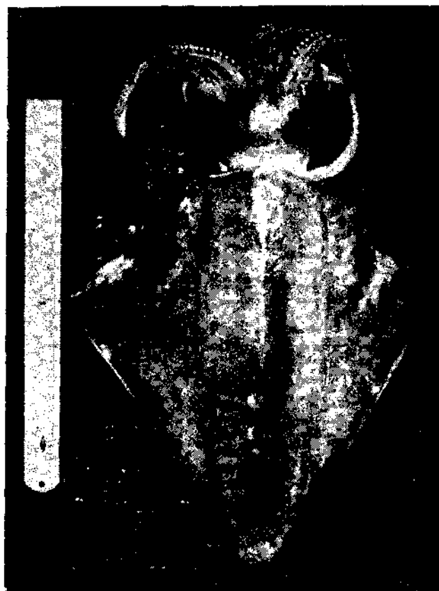
Fig. 1. Dorsal view of the Diamond-back squid.

* Reported by A. P. Lipton, Veraval Research Centre of CMFRI, Veraval.