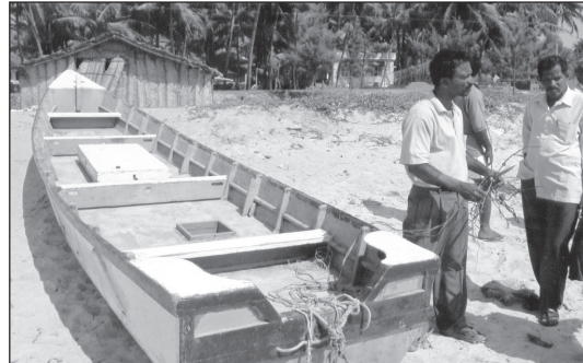
Fig. 2 Fibre boats used in cephalopod fishery

Deployment of FAD: The operational area for the fishery extends off Manjeshwara in south (north Kerala) to Byndoor in north (Karnataka). Prior to the commencement of actual fishing operation, few trips are made to survey and select suitable areas for laying the FADs. Since rocky reefs and muddy areas