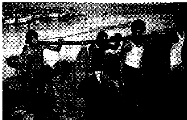
Fig. 1. M. dobsoni being unloaded from trawlers at Paradeep.

During the peak season commencing from September to February about 300 mechanised trawlers operate at Paradeep and during the off season from March to August, only 30 to 50 trawlers used to operate. But this year on an average 140 trawlers operated daily at Paradeep during March and April 1995 due to large scale occurrence of the prawns. Most of the trawler