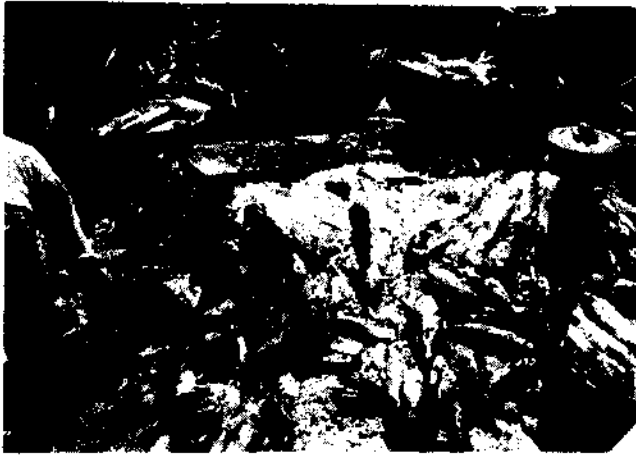
Fig. 1. Catch of catfish T.tenuispinis with incubating eggs landed by purse seiner at Karwar.