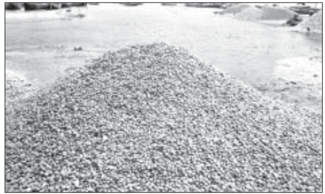
Closer view of dried clam shells (shells of M. casta and V. cyprinoides )

Pulicat Lake, black clam is totally absent.