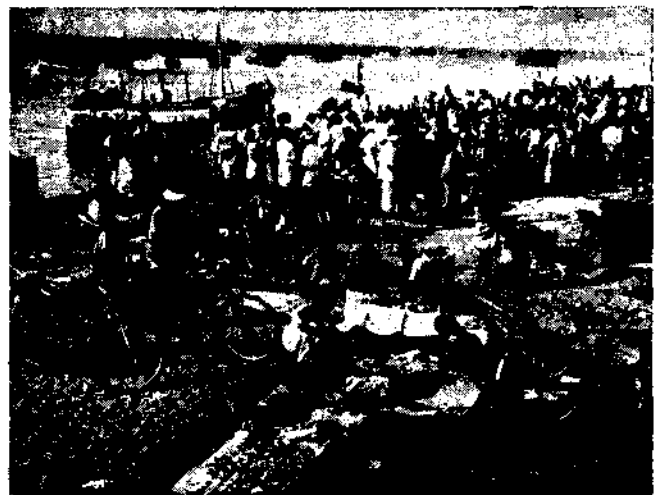
Fig. 5. Resting mechanised boats and crowd awaiting the catches landed by carrier boats at Kottapattinam.