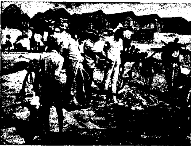
Fig. 4. Crabs from the catch for disposal at Kottapattinam.