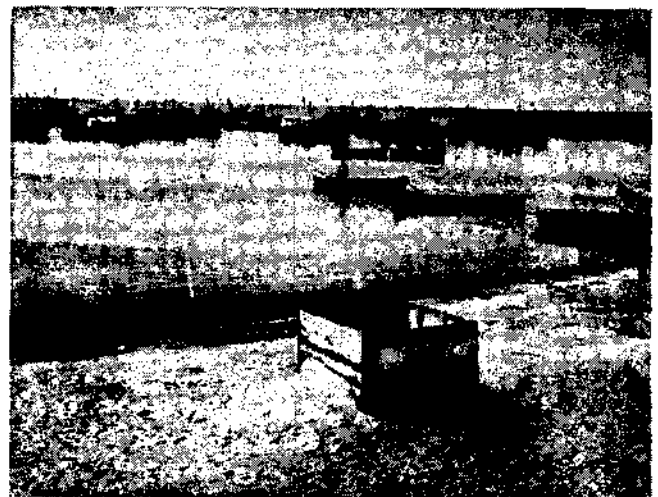
Fig. 7. Calm and quiet.