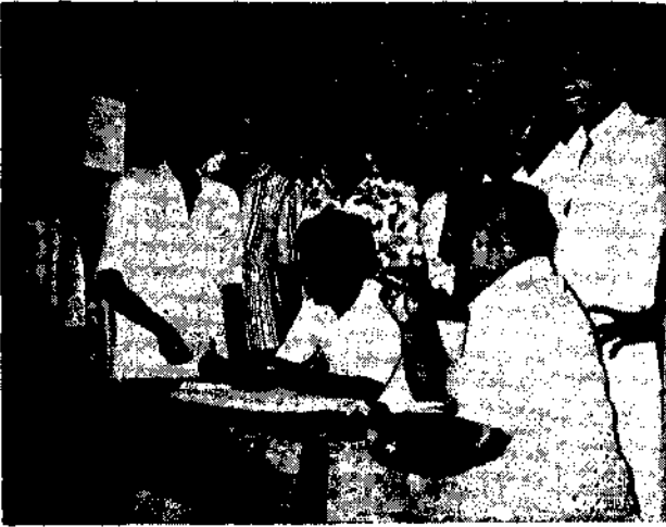
Fig. 2. Boat owners queuing up for receiving tokens at Jagathapattinam.