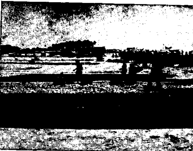
Fig. 6. Sun drying Silver bellies 'kaaral', part of the catches.