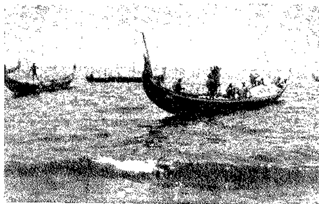
Fig. 3. The 'chundan vallam' from which the 'ringu vala' is operated

Thryssa sp. and sciaenids were also landed in addition to anchovies, sardines, mackerel, cat fish, rainbow sardines and carangids. Landing of Megalaspis cordyla in a substantial quantity on a day was rather unusual to this area. It is also to be recorded that after many years, fishes were found drying on the shore and sciaenids, anchovies and carangids found place in them.