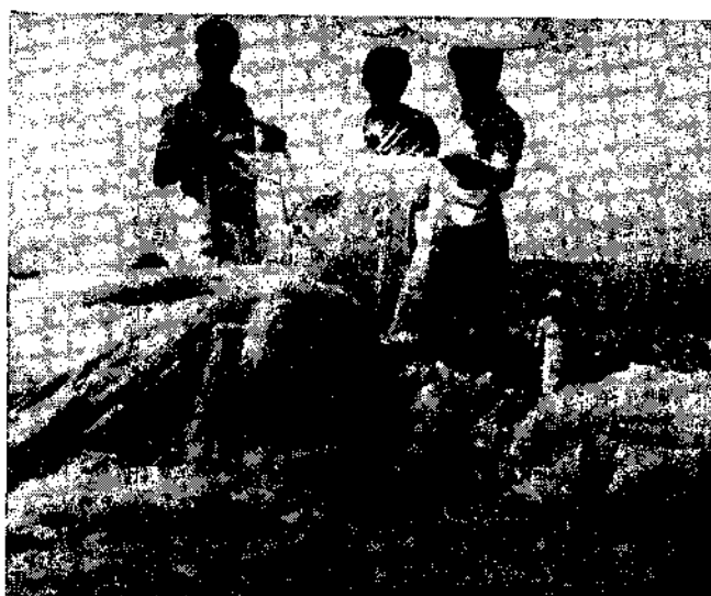
Fig. 1. A 'Ringu vala' on the shore.

'Ringu vala' (Fig. 1) is made of long wall of netting with head rope and foot rope. Each net generally has