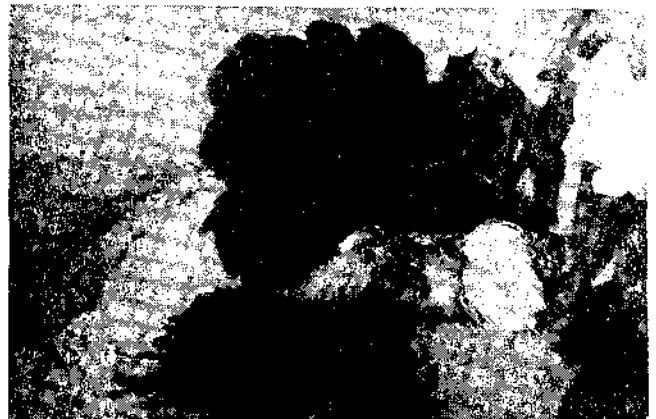
Fig. 2. Long lines and the hooks used for shark fishing at Elathur, Calicut.

was used as bait. It was captured northwest of Elathur at about 35 m depth. A blue coloured high density polyethylene strap was found encircled around the girth of the body just in front of the pectoral fins. The two ends of the strap were seen melted and jointed with no mark of any metal punching. There was no infor-