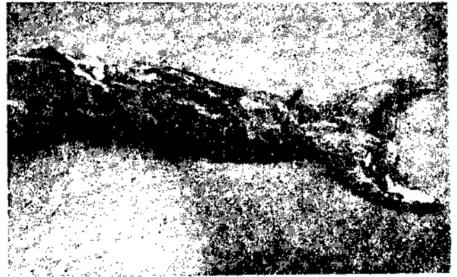
Fig. 3. Posterior portion of the whale showing the caudal flukes.