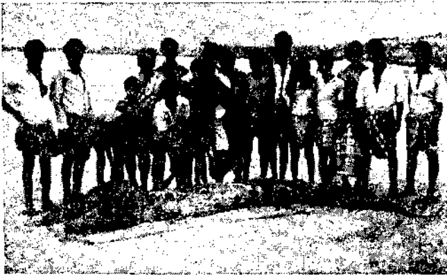
Fig. 1. Dorso-lateral view of the Baleen whale landed at Madras.