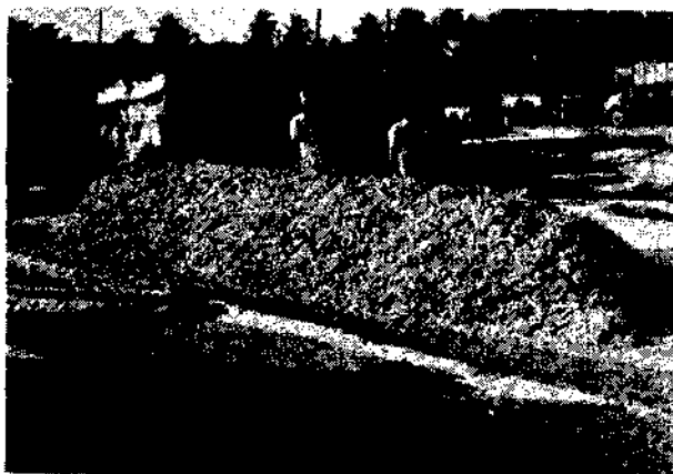
Fig. 8. Sun-dried whitebait at Gangoli ready for packing and transport to distant markets outside the State.