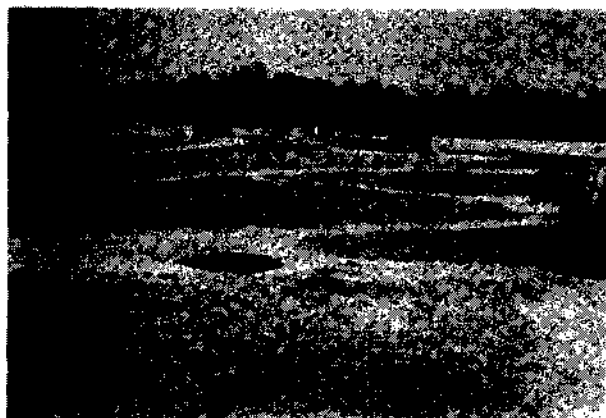
Fig. 6. Whitebait being sundried on the beach at Malpe.

fish are still on board the vessel at the landing centres. At Cochin most of the catch, mixed with crushed ice, is sent to marketing centres for consumption in fresh condition. At Mangalore, Malpe and other centres in Karnataka, however, only a portion of the catch, about 10%, finds ready market for consumption as fresh fish. This is mixed with crushed ice and transported by lorries to the nearby and far flung markets within and outside the State (Figs. 4 & 5). The remaining 90% of the catch was quickly transpor-