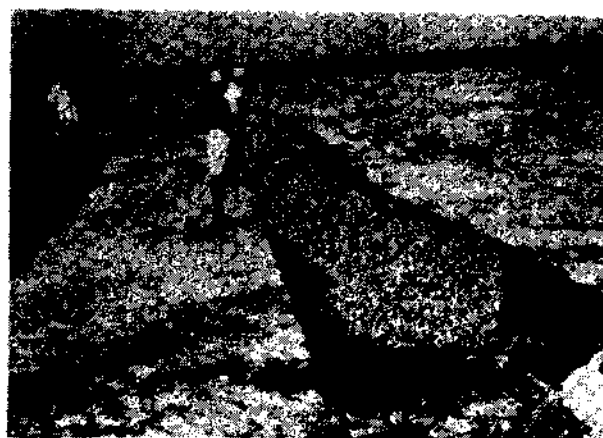
Fig. 7. Whitebait being sundried on the beach at Ullal.

ted by the same boats that landed the catch or by lorries to the adjacent vast and sandy beaches for sundrying. Thus during the 1980 whitebait fishing season in Karnataka most of the whitebait landed could be sun dried and marketed as dried fish, as sunny weather prevailed during the period (Figs. 6 & 7). Only in a single instance, on 19th November, the catch could not be beach-dried owing to cloudy weather, and the fish amounting to about 70 tonnes had to be converted into fish meal.