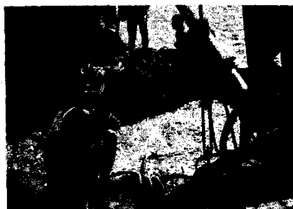
Fig. 1. Purse seiner with whitebait catch at Mangalore Fisheries Harbour.

During the peak whitebait season it was generally observed that the purse seine units exploiting this resource off Mangalore were able to get pure catches amounting to 2-10 tonnes, usually 5-6 tonnes, per haul (Fig. 1), while off Cochin usually 2-3 tonnes with very little amount of miscellaneous catch. These characteristics of the purse seine fishery are to be taken into consideration while estimating the catch and effective effort for the exploited resource both for the day and the season. It is also observed that at Mangalore, where the largest fleet of purse seiners is operated, the purse seine fishermen seem to exercise some sort of selective fishing in favour of those resources that fetch higher and more remunerative prices.