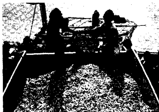
Fig. 4&5. Whitebait being loaded into lorry from the boat at Mangalore for transport to distant markets outside the state.

The whitebait catches are auctioned while the