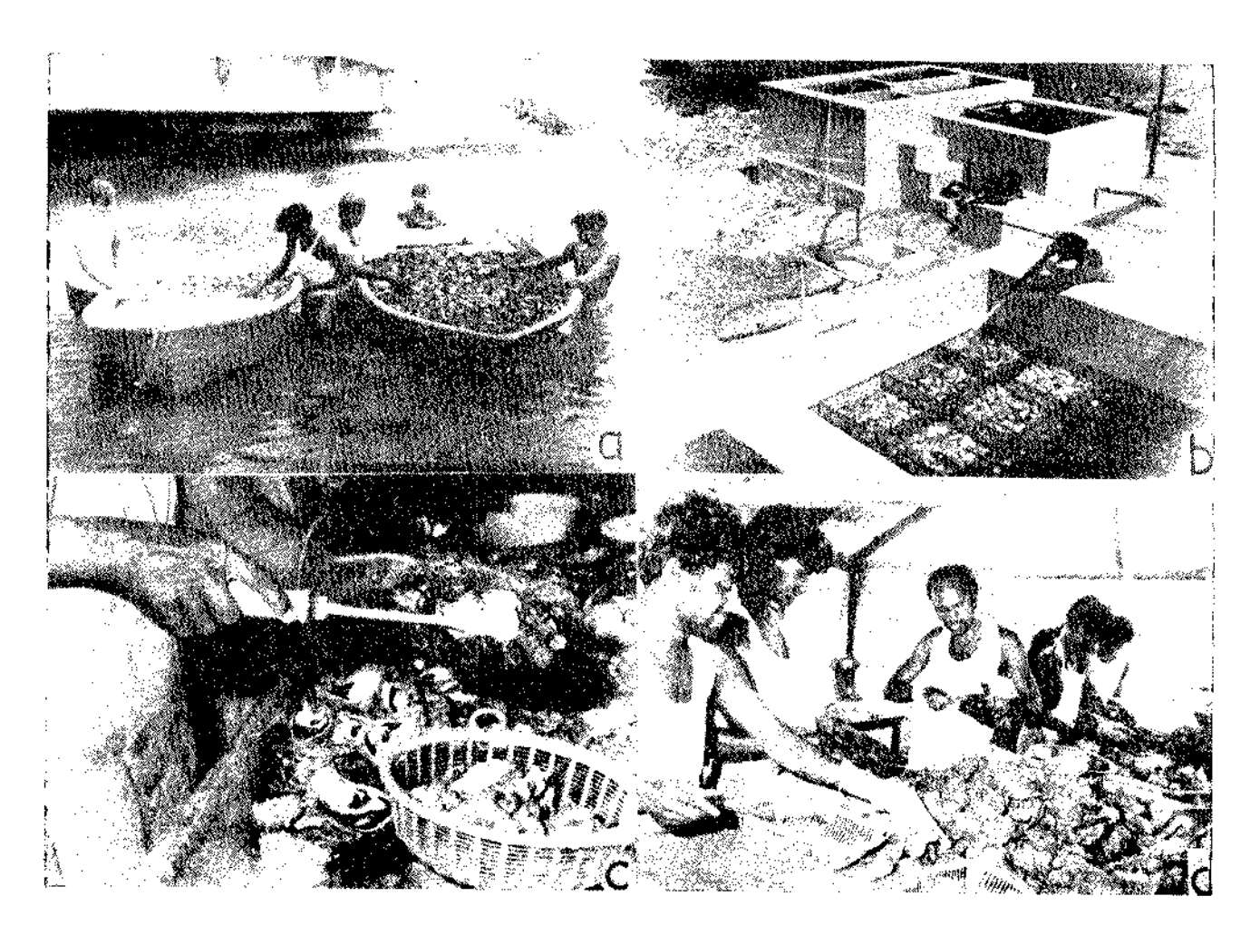
PLATE 1. a Harvested by sters. b Oysters kept in tank for initial cleaning. c and d Oyster meat being shucked from the depurated by sters.